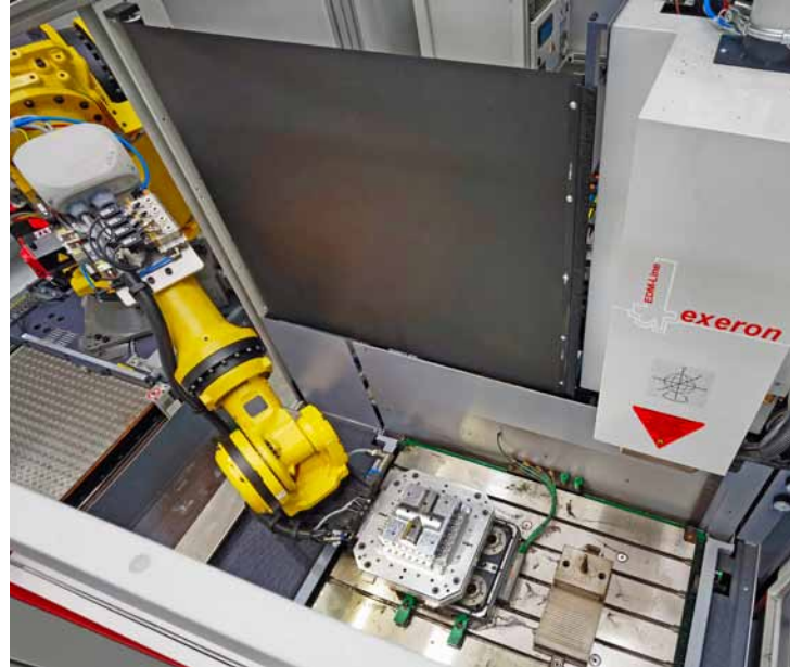
Setting down a pallet on the zero-point clamping system of the penetration EDM system from Exeron

coordinate measuring and, in addition, professional wet cleaning were fully integrated," reveals J. Kopsieker, "so that we could operate all of our key technologies in an automated and linked manner." Added to this were storage facilities for milling tools and electrodes, as well as for workpieces mounted on Erowa pallets. All transport tasks are performed by a handling robot running on a linear rail. Within this cell, all processes are completely unmanned. The task of the employees is to supply the cell with the workpieces to be processed and the necessary tools. They are also responsible for creating the NC programs for all integrated production processes. The cell is fully controlled by the RMSMain job manager from Röders. RMSMain itself is linked upwards to the company's IT hierarchy based on the ERP system IK Office.