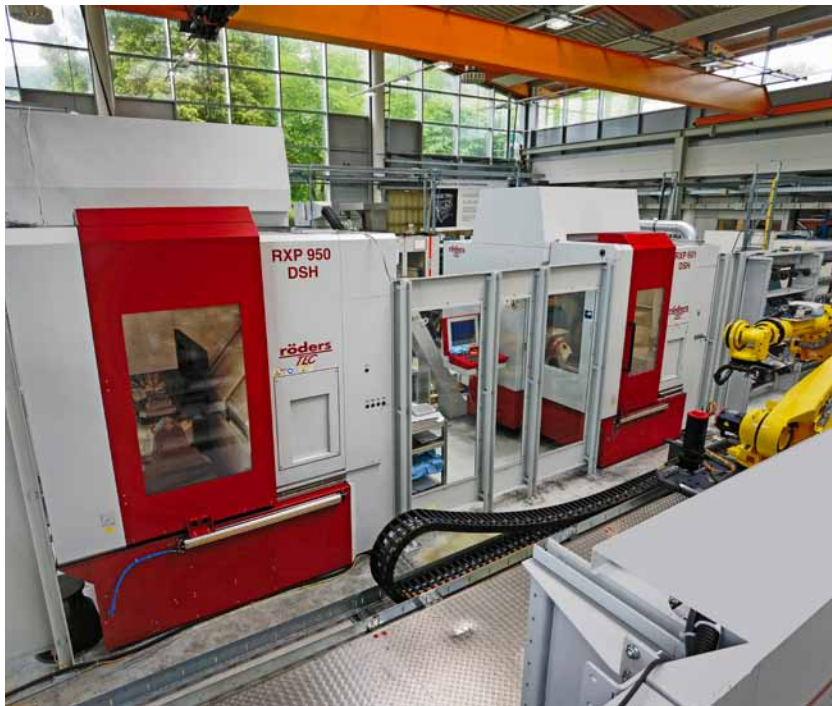
The core components of the cell include two Röders HSC milling centers of the RXP series as well as a handling robot on a linear rail

In mold and die making, a profound transition is taking place. The previously favored juxtaposition of individual machines requiring high labor intensity is gradually replaced by complex, fully automated cells with integrated handling combining