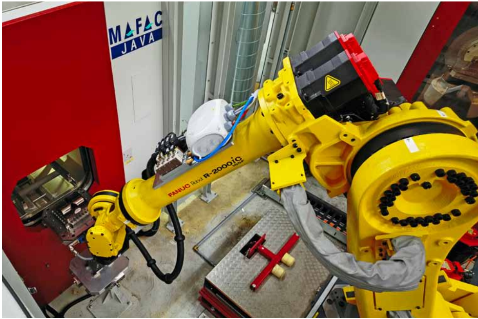
A palletized workpiece is introduced into the Mafac washing system