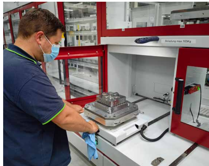
Feeding a palletized workpiece into the airlock of the cell

In addition to the two milling machines, the cell also includes a coordinate measuring machine from Hexagon, a penetration EDM plant from Exeron and an automatic washing system from Mafac. Tools and workpieces are supplied to and removed from the cell via an airlock. Here, blanks clamped on pallets are fed in and finished mold components are discharged. All other processes within the cell take place automatically, coordinated by the RMSMain job manager, without any need for the staff to intervene.