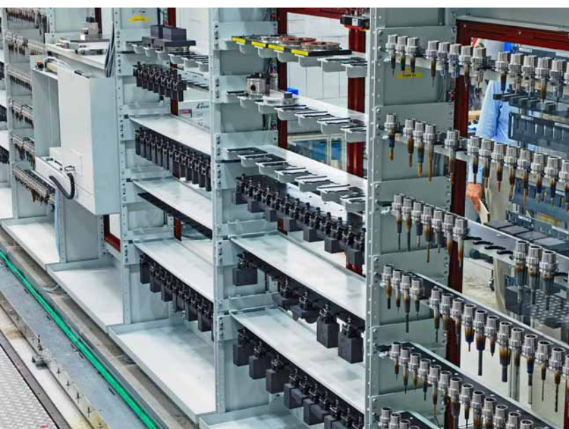
Tools lined up at the sides of the cell, ready to hand, as well as clamped blanks for graphite electrodes; behind them, the airlock for loading and unloading

"We wanted an automated manufacturing cell in which a wide variety of technologies such as five-axis milling, penetration EDM,