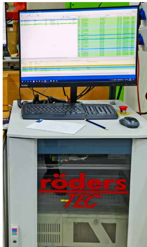
The RMSMain job manager coordinates all processes in the cell and communicates with the work preparation department and Festool's ERP system