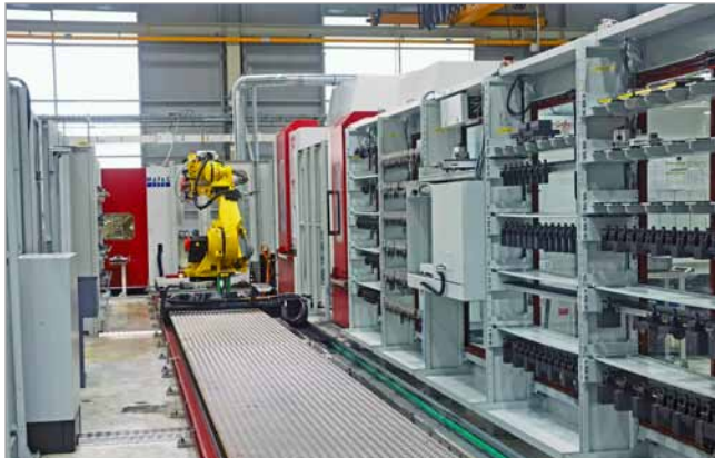
The robot running on a linear rail operates three machine tools, the coordinate measuring machine and the washing system. Material, pallets and tools are lined up on shelves